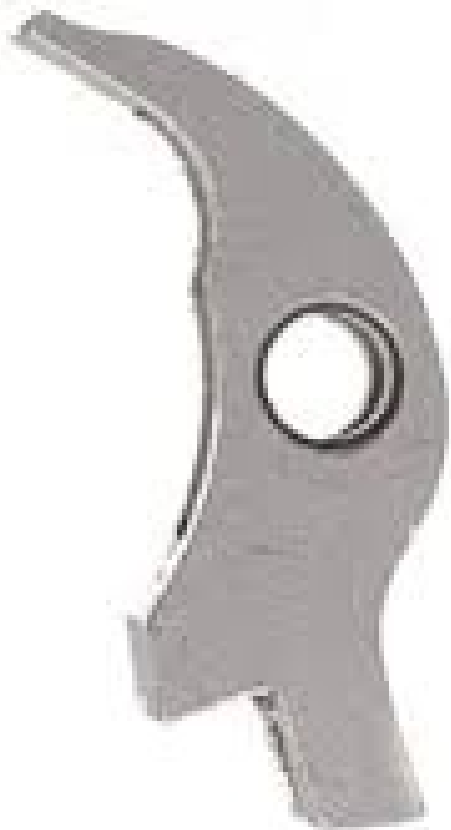
Created over 100 years ago I can still be found in guns on the firing line with mind numbing regularity even today.

EMAIL YOUR ANSWER TO NEWSLETTER@PUEBLOSHOOTERS.ORG FOR OFFICIAL BRAGGING RIGHTS.